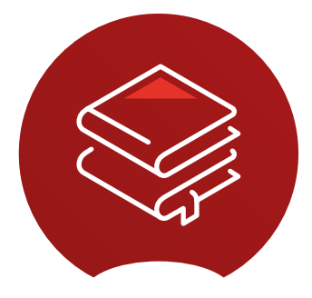
Infographics or guides: covering the 'how to' of a topic/ product provided

in a PDF version branded to your organisation